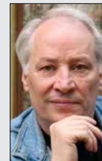
Joe R. Lansdale

PulpFest will welcome Champion Mojo Storyteller Joe R. Lansdale as its 2018 Guest of Honor. The author of over 40 novels and many short stories, Lansdale has also written for comics, television, film, Internet sites, and more. His work has been gathered into more than two dozen short-story collections, and he has edited or co-edited over a dozen anthologies.