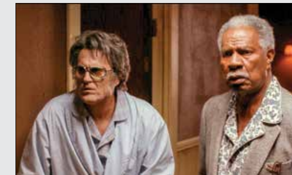
Bruce Campbell, Ossie Davis in "Bubba Ho-Tep"

His novella "Bubba Ho-Tep" was adapted to film by Don Coscarelli, starring Bruce Campbell and Ossie Davis. His story, "Incident On and Off a Mountain Road," was adapted to film for Showtime's MASTERS OF HORROR , and he adapted his story "Christmas with the Dead" to film himself. The film adaptation of his novel COLD IN JULY was nominated for the Grand Jury Prize at the Sundance Film Festival, and the Sundance Channel has adapted his Hap & Leonard novels for television.