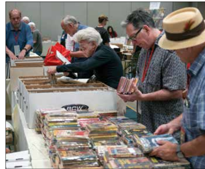
Pulp collectors in the PulpFest 2019 dealers' room

You'll find our full programming line-up at pulpfest.com/programming/.